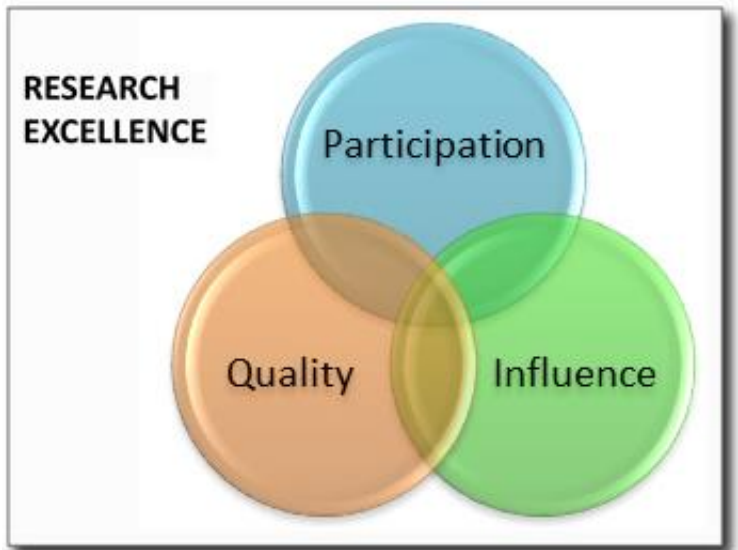
Figure 1 A provisional diagram of “Research Excellence” used to start the dialogue at the Learning Forum.

This metaphor provided the basis for the Learning Forum agenda and design, and while not perfect, this provisional framework served as a catalyst to encourage learning through dialogue, and a conceptual model that participants referred to and refined throughout the Learning Forum.