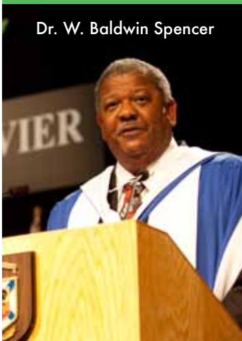
Dr. W. Baldwin Spencer

International Institute beginning in 2010.