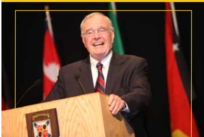
Former Canadian Prime Minister Paul Martin addresses the audience at the Gala Dinner