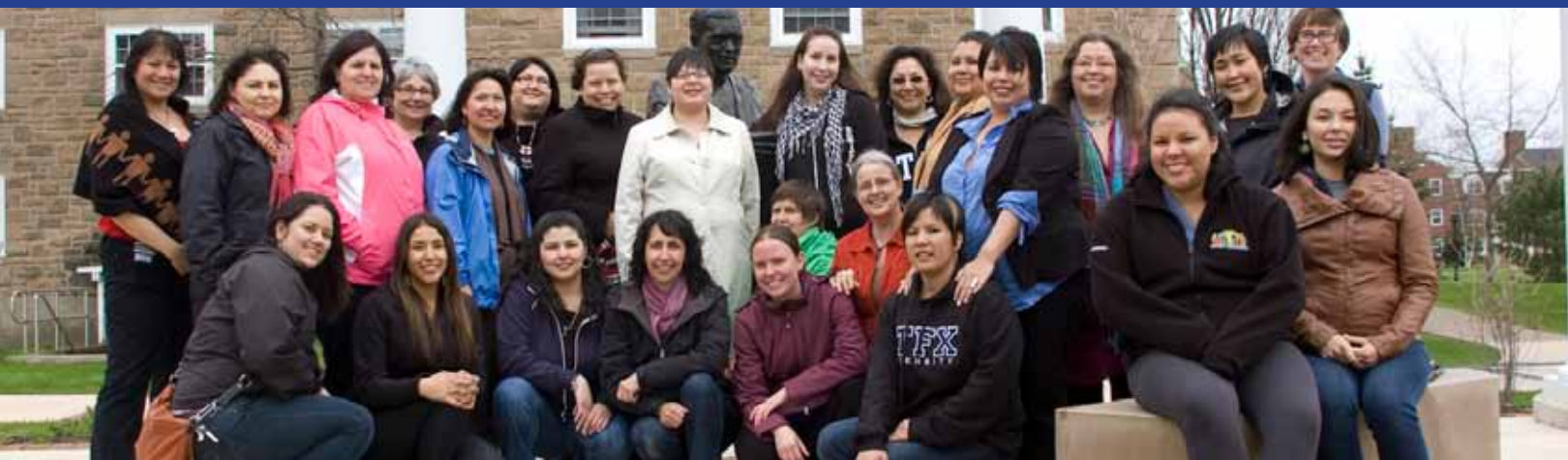
Participants, facilitators and mentors of the 2011 Indigenous Women in Community Leadership program

For more information on the Indigenous Women in Community Leadership program, visit www.iwomenlead.ca . Podcasts involving the program mentors can be heard at coady.libsyn.com .